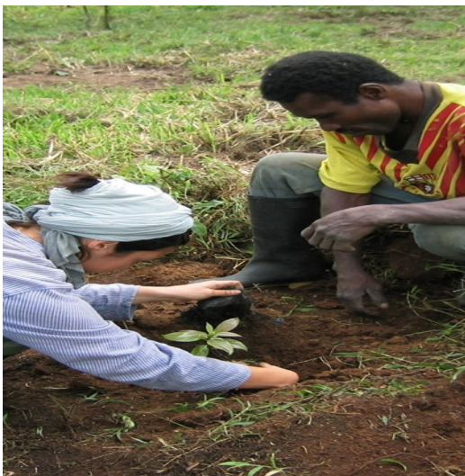
REFORESTATION IN THE RESERVE

If you need a taxi to pick you up from the airport, or to take you there we can arrange this service. You just need to ask for it in advance and the fee will be paid directly to the taxi driver.