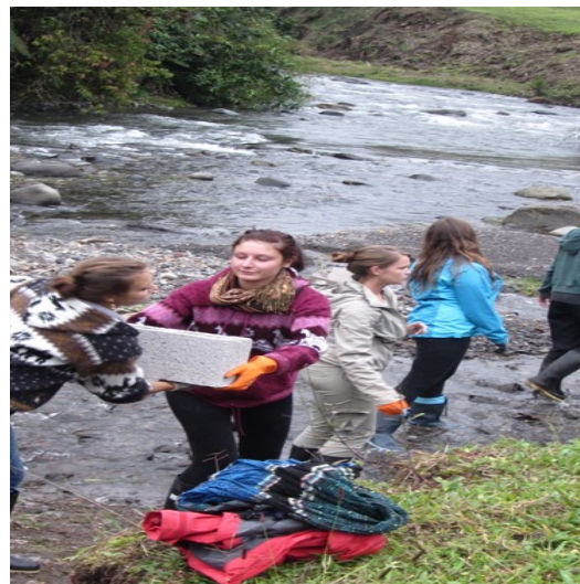
CONSTRUCTION IN THE RESERVE