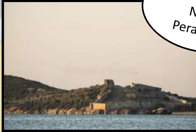
Castle of Nea Peramos