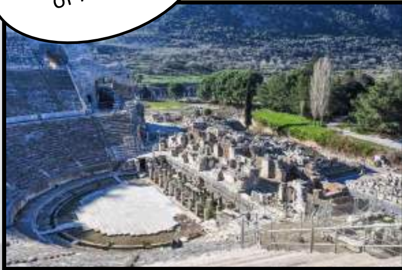
Ancient city of Philippi