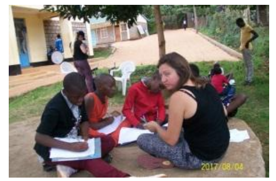
International volunteer from France training junior artistes at Kisii cultural center 2017

It is quite motivating to work with children at Kisii cultural center. Newstar Drama Group is among very few groups that develop, train and nurture children talents in Kenya.