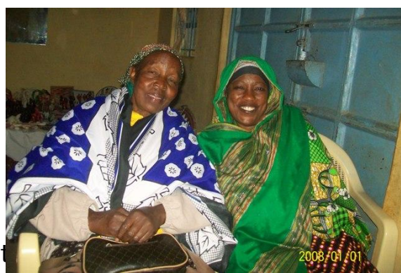
AGE: Volunteers have to be at least 18 years old tamp. There is no upper age limit.

PROJECT ACTIVITIES : Volunteers will work for six hours daily from Monday to Friday.