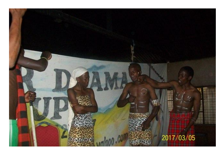
Newstar drama group performs a set book (play) entitled the river and the source at Murkan secondary school in Narok county (Kenya)

The group makes travel tours to secondary schools to various parts of Kenya. The project is main income for the group. The schools pay the group for the services and it is from this source of income of artistes are paid their salaries. The group at least performs 150 shows per year. This is one of the most interesting programs which expose group artists to travel to many parts of Kenya. They are like local tourists. The live literature set books' drama performance is relevant, realistic and satisfactorily, especially assisting students to grasp books contents with ease. The program enables students to understand fully - plots, devices and intensions of the writers. This will in long run contribute to good results in English and Kiswahili subjects in national examination. This programs plays a very important role to prepare young Kenyans for future as they do well in National Examination which make them go for their dream courses at universities and middle level colleges ,not only that, also the program inspires young actors and actresses in secondary schools who watch group performances on stage.