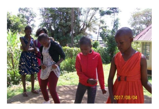
Newstar junior artistes presenting a poem in French at Kisii cultural center August 2017

It is quite interesting and exciting to see young artistes at early age of seven acting, dancing and narrating stories.