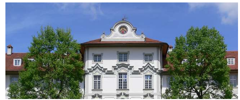
The school was funded in the castle of Bad Wurzach - there is a new building now, but the library is still in this amazing building!