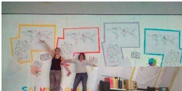
They asked all students where they were from and made a big world map

( https://www.youtube.com/watch?v=ikEyBI_JnhA&feature=youtu.be )